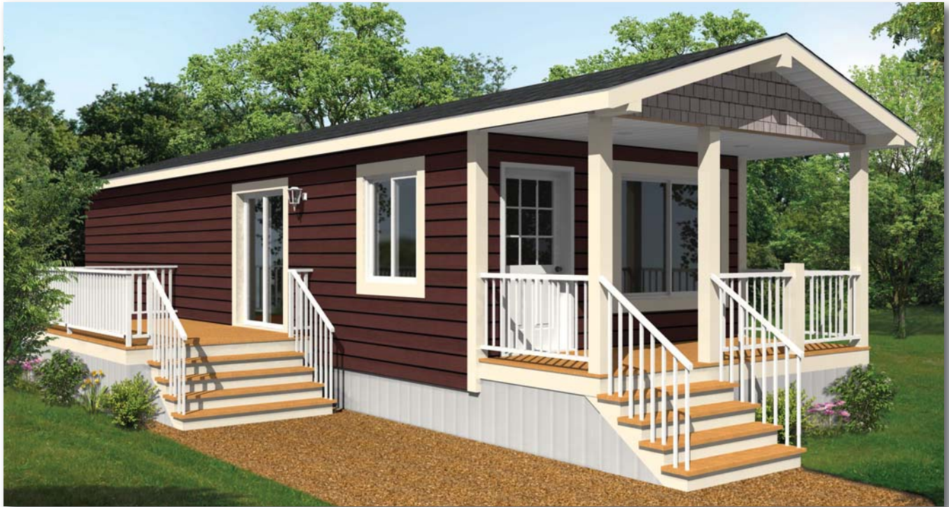
“The Riverview” 14' x 50', 616 sq. ft., 2FL-1B