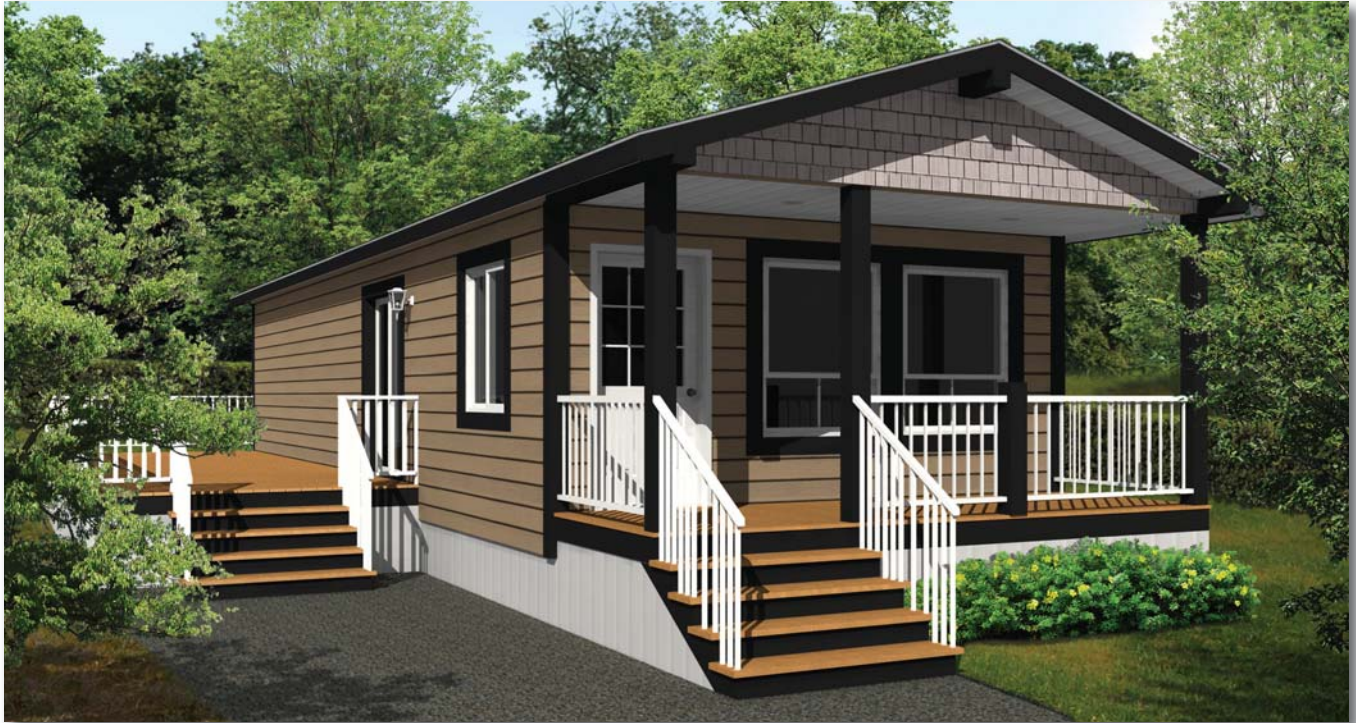
“The Fairview” 16' x 50', 704 sq. ft., 2FL-1B