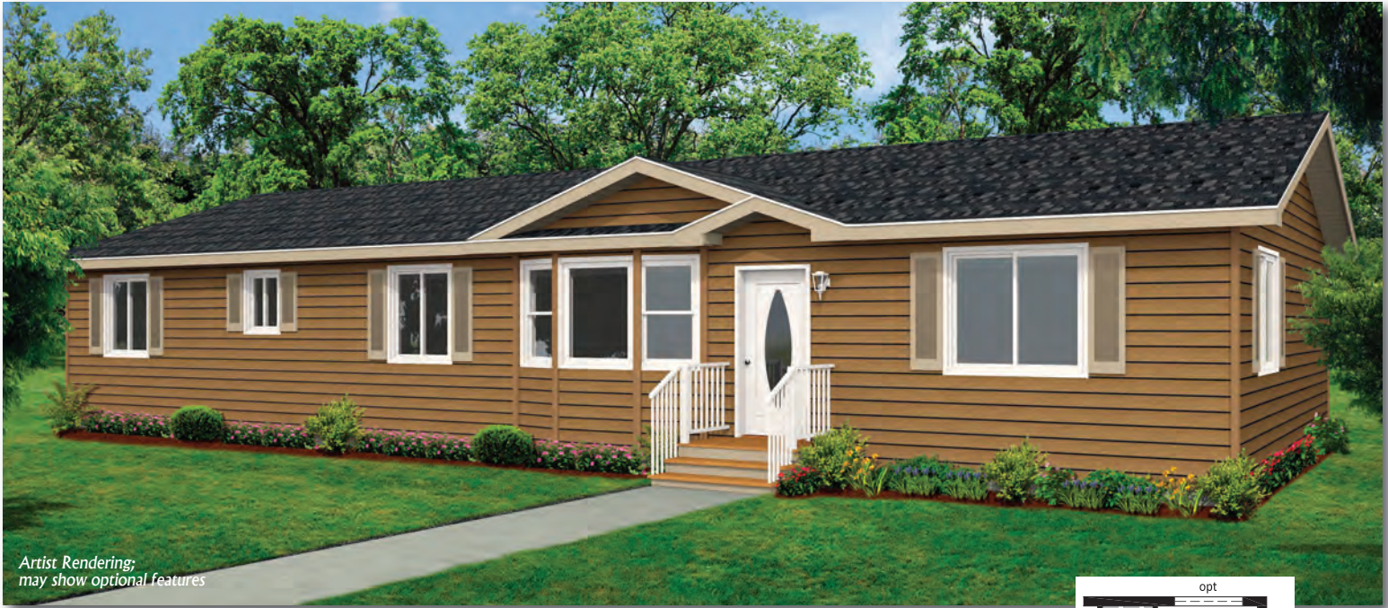
Artist Rendering; may show optional features

Suggested Stairway Location for Basement Model