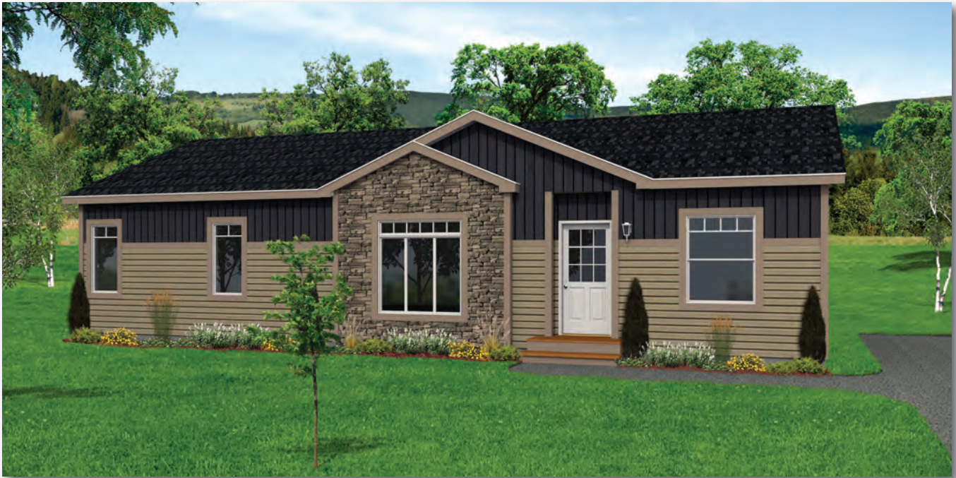
The Cambridge ST-7522 27' x 52' • 1,404 sq. ft.

Some exterior features shown may be optional or done by others on site.